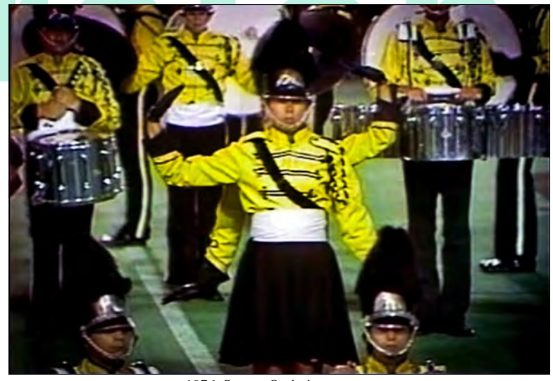
1976: Seneca Optimists concert

These Corps were considered two of the best in Canada and each had