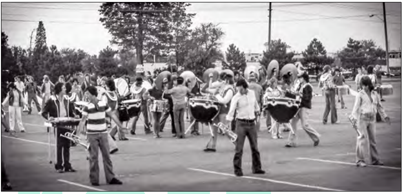
1976: Seneca Optimists rehearsing

Information Drum Corps, a C.D.C.A. publication since 1972, under the direction of Al Tierney, advertised the Toronto Optimists 1975 yearbook. It was forty pages,