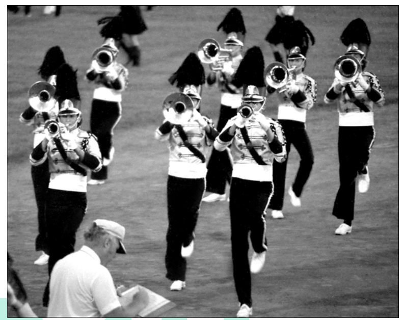
1976: Seneca Optimists (Michigan City)

Corps had started out on top. In 1975, the Oakland Corps had started out in second, picking up steam as the year progressed. Seneca Optimists were off to a good start. It continued. A second victory over the Crusaders was recorded one week later, at Seagram Stadium in Waterloo. Things were looking good until Ajax, one week later. Having a reputation, for any Optimist Corps, as "loser city", this strange tradition was upheld. For the first time in three contests, Oakland Crusaders won at this location. As if to bear out whatever misgivings that our Corps had about Ajax, the very next day, in Peterborough,