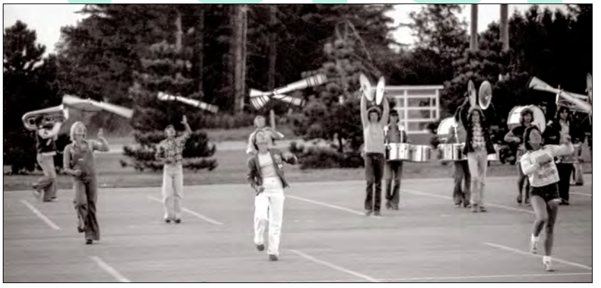
1976: Seneca Optimists rehearsing

Ominously, on the same date, the Oakland Crusaders placed only 0.45 behind Phantom Regiment, of Rockford, Illinois. With a score of 83.65, they were seen to be rapidly improving, just as they had last year. Their U.S. scores were now surpassing those of the Seneca Optimists.