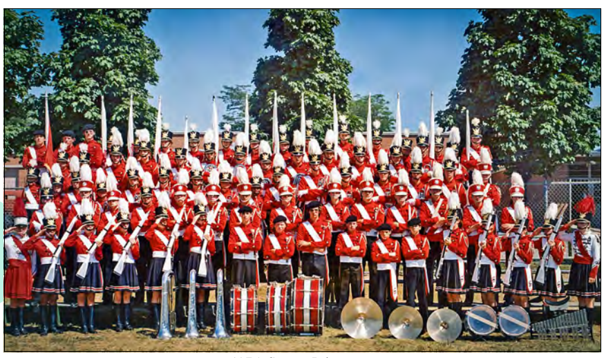
1975: Seneca Princemen

Corps. Had it been seen as such, it would not have worked as well as it did, with executive and members of both units meshing almost immediately and working smoothly, together. There was some dissatisfaction, which resulted in a falling away of some people. This is almost inevitable. We saw it in 1958 with the Optimist Trumpet Band and Danforth Crusaders. Eventually, on February 8th, after much planning, politicking, and maneuvering, here is how things settled.