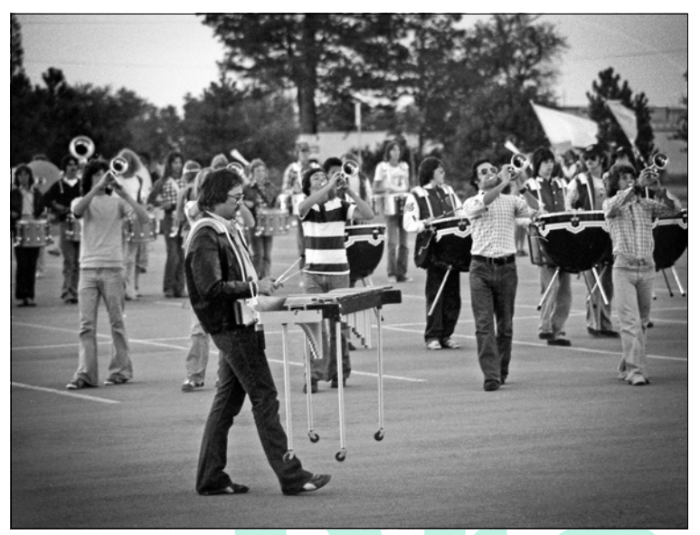
1976: Seneca Optimists rehearsing

The Cadet/Lancers, growing in quality, had a tour booked in the United States this year, from July 1st to July 5th. They would be doing parades and contests in New York and Pennsylvania.