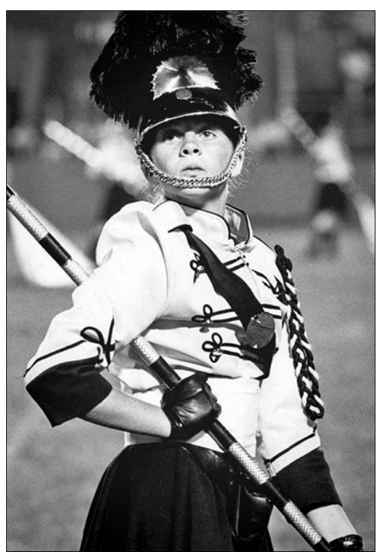
1976: Seneca Optimists (World Open)

Ontario, the tables were turned, again. The Seneca Optimists scored a full five-point victory over their rivals. Strange business, this. So strange, in fact, that the future would see some reaction to this situation. Following in rapid succession were contests in Welland and Kitchener, Ontario, against the same Corps. Then Tonawanda, NY, Kingston, NY, Oswego, NY and Fort Wayne, Indiana. These shows were against other Corps, in neutral territory. Seneca Optimists were