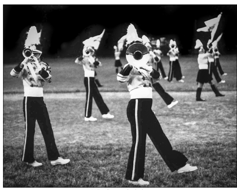
1976: Seneca Optimists

A phone call signalled the moment. A great shout of joy went up. They had captured eleventh place, making the finals. The score, 83.50. They were over the Troopers, and only 0.75 out of