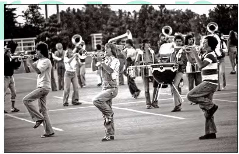
1976: Seneca Optimists rehearsing

On September 25th, the Corps helped launch a new parade Corps in Owen Sound. This was the Georgian Lancers, and Seneca played their show at a local school in order to publicize the Drum Corps. There was not much activity in this region.