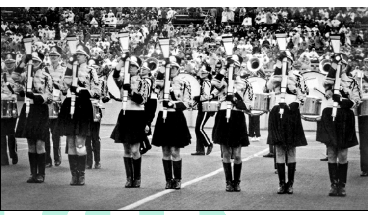
1976: Seneca Optimists rifles

With numerous corps in the prelims one's score and placing were not known until sometime later, after