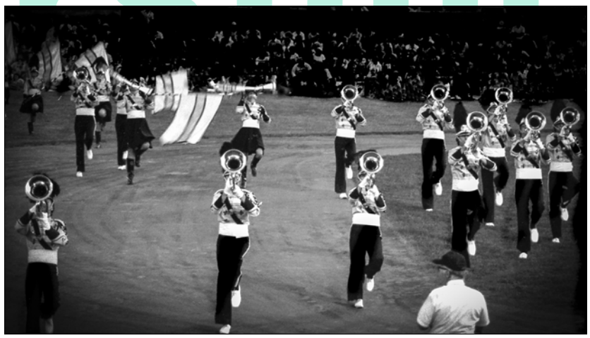
1976: Seneca Optimists (Michigan City)

The Individual results were not totally an indication of what would happen on the field this year, though the guard captions were.