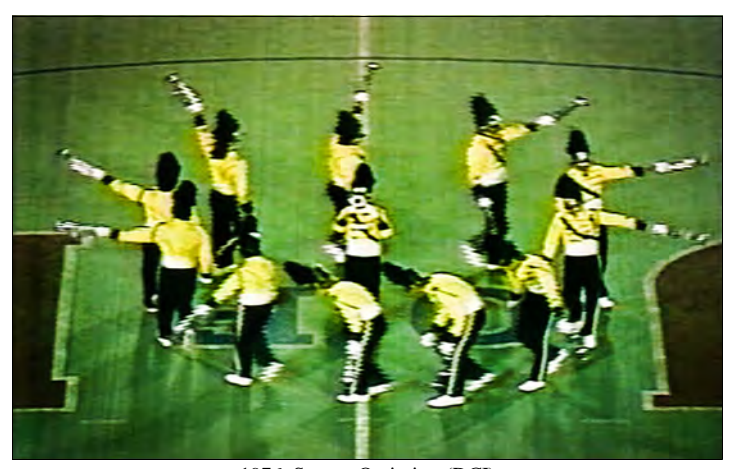
1976: Seneca Optimists (DCI)

On July 31st, the Seneca Optimists, the "Mellow Yellow" as they were now being tagged, took off for Ogdensburg, N.Y. Their main Canadian rival, Oakland Crusaders, was on a U.S. tour. During this, they placed fourth, on July 31st, eight points behind the winning Phantom Regiment. Three weeks