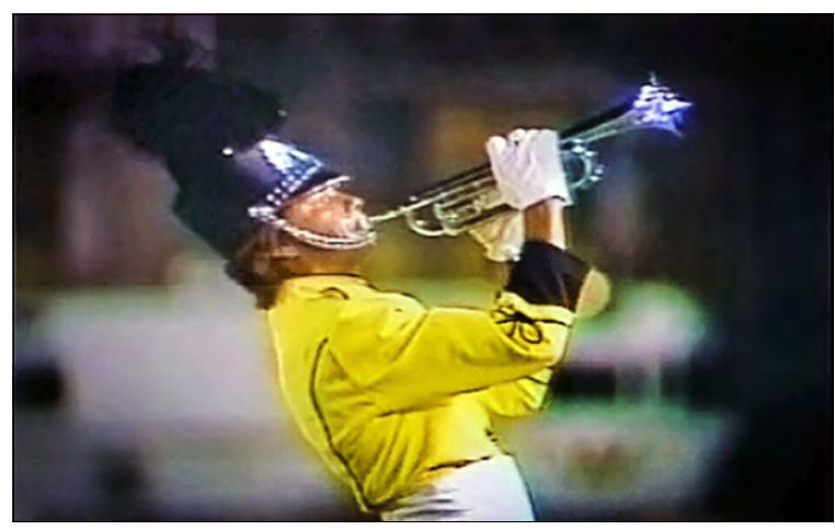
1976: Seneca Optimists (DCI Finals)

Rochester, N.Y., was the next arena for our Corps. It was still somewhat of a Corps town, but not the hotbed of activity that it had once been. It would be once again. Lots of D.C.A. shows would be held here. D.C.A. was the senior version of D.C.I., though no doubt with some differences.