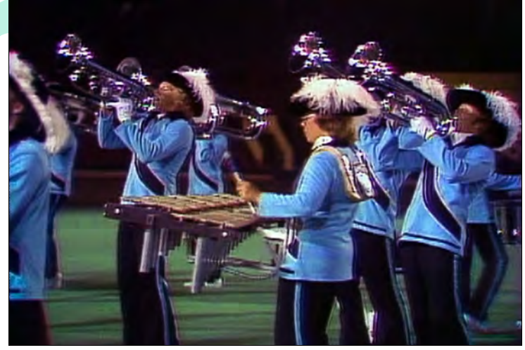
1976: Oakland Crusaders (DCI Finals)

That the merger had worked well was proven by the fact that the Seneca Optimists defeated the Oakland Crusaders in their first ever competition. A difference between now and last year was that the newest