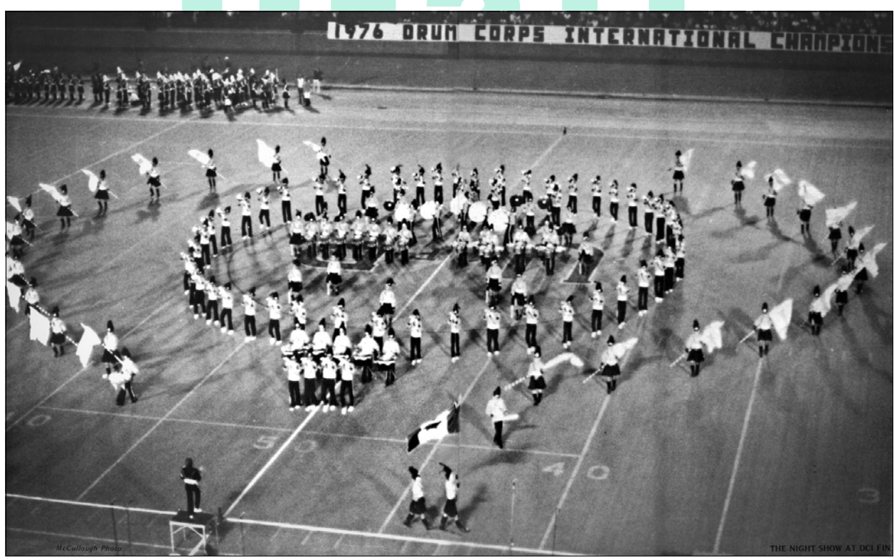
1976: Seneca Optimists (DCI Finals)

So, for the Seneca Optimists Drum and Bugle Corps, it was back to the drawing board, buckle down to work. There was a large crowd left, ready to go at it again.